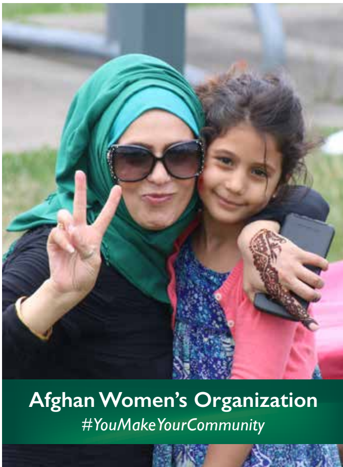
Afghan Women's Organization #YouMakeYourCommunity