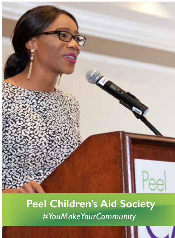
Peel Children's Aid Society #YouMakeYourCommunity