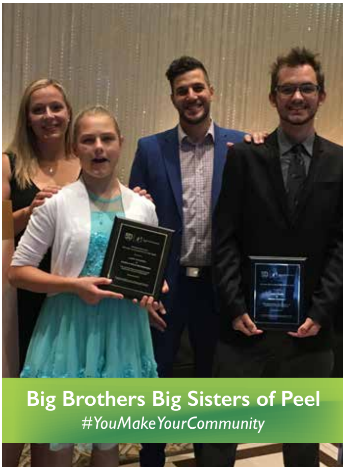
Big Brothers Big Sisters of Peel #YouMakeYourCommunity