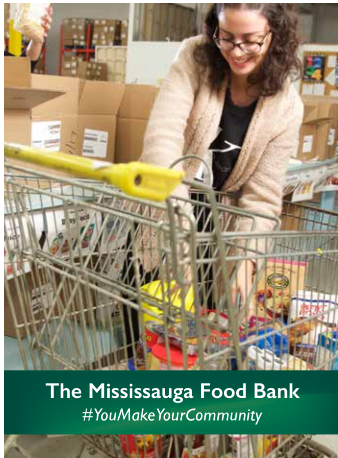
The Mississauga Food Bank #YouMakeYourCommunity